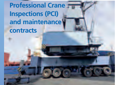
Professional Crane Inspections (PCI) and maintenance contracts