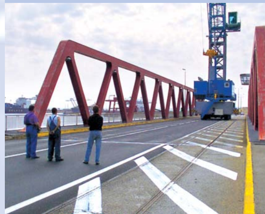
Thanks to the remote control system, the time-consuming climb to the cab of a WSG can be avoided when only a single container needs to be handled