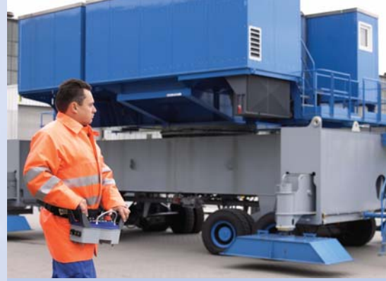
Using the remote control system at ground level, the crane operator can move the crane carefully and position it accurately