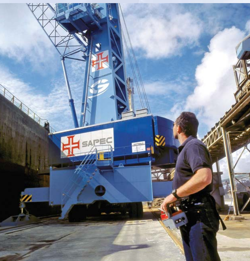
Travelling and controlling an HMK 170 EG via Gottwald's remote control system on a very narrow quay at Sapec, Portugal

This is of particular advantage when positioning a crane on a relatively narrow quay.