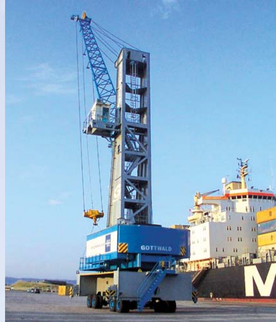
Repositioning an HMK 170 E by means of the Gottwald remote control system over a distance of 4 km at Port Autonome du Havre, France